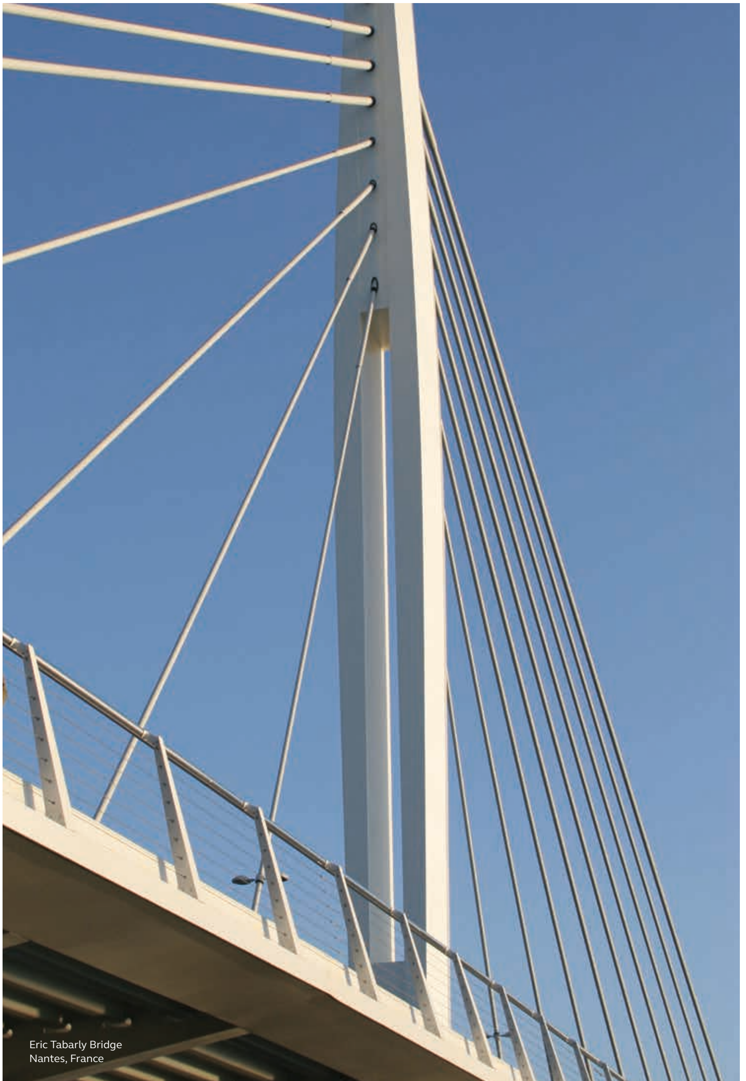
Eric Tabarly Bridge Nantes, France