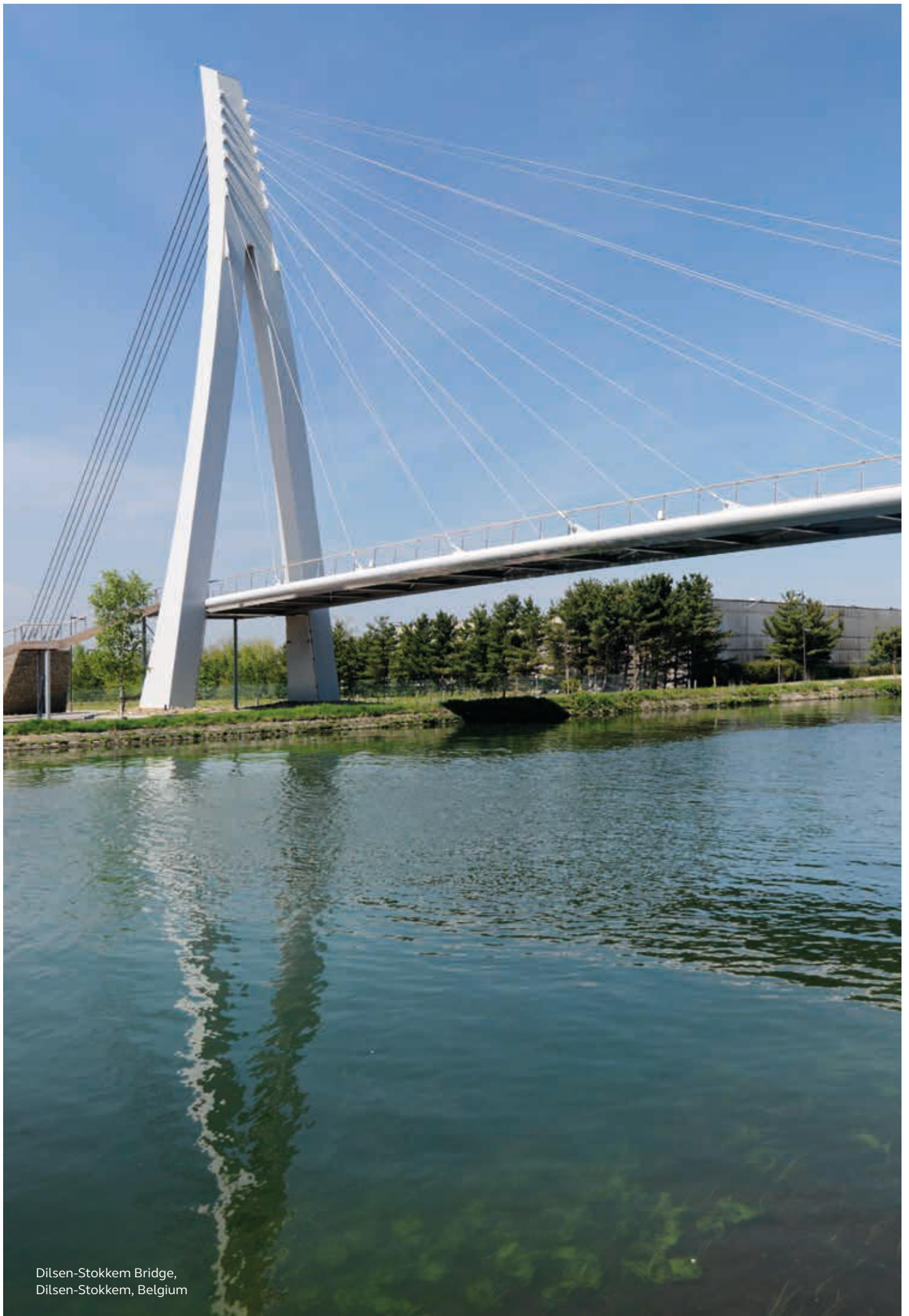
Dilsen-Stokkem Bridge, Dilsen-Stokkem, Belgium