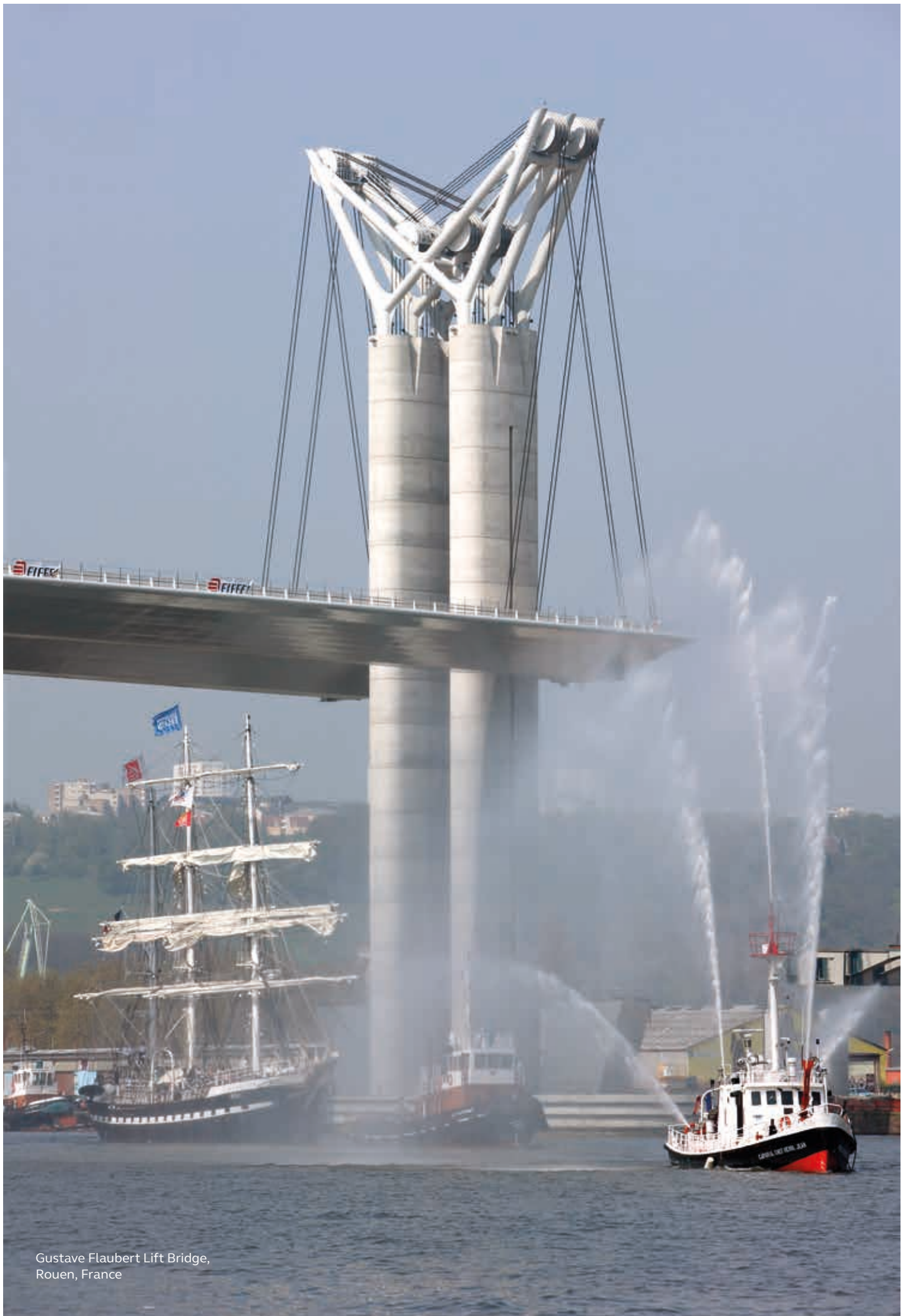
Gustave Flaubert Lift Bridge, Rouen, France