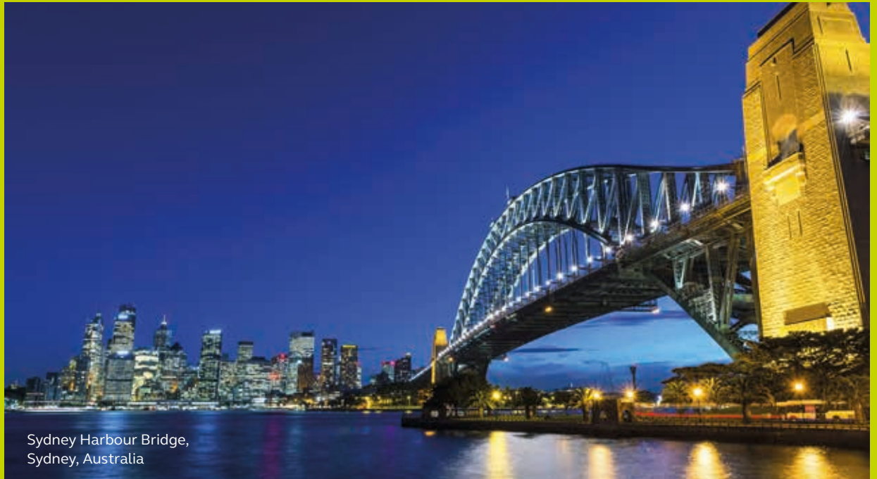
Sydney Harbour Bridge, Sydney, Australia

The mega trends of the 21st century will bring rapidly increasing levels of urbanization as the global population is set to reach nearly 10 billion by 2050.