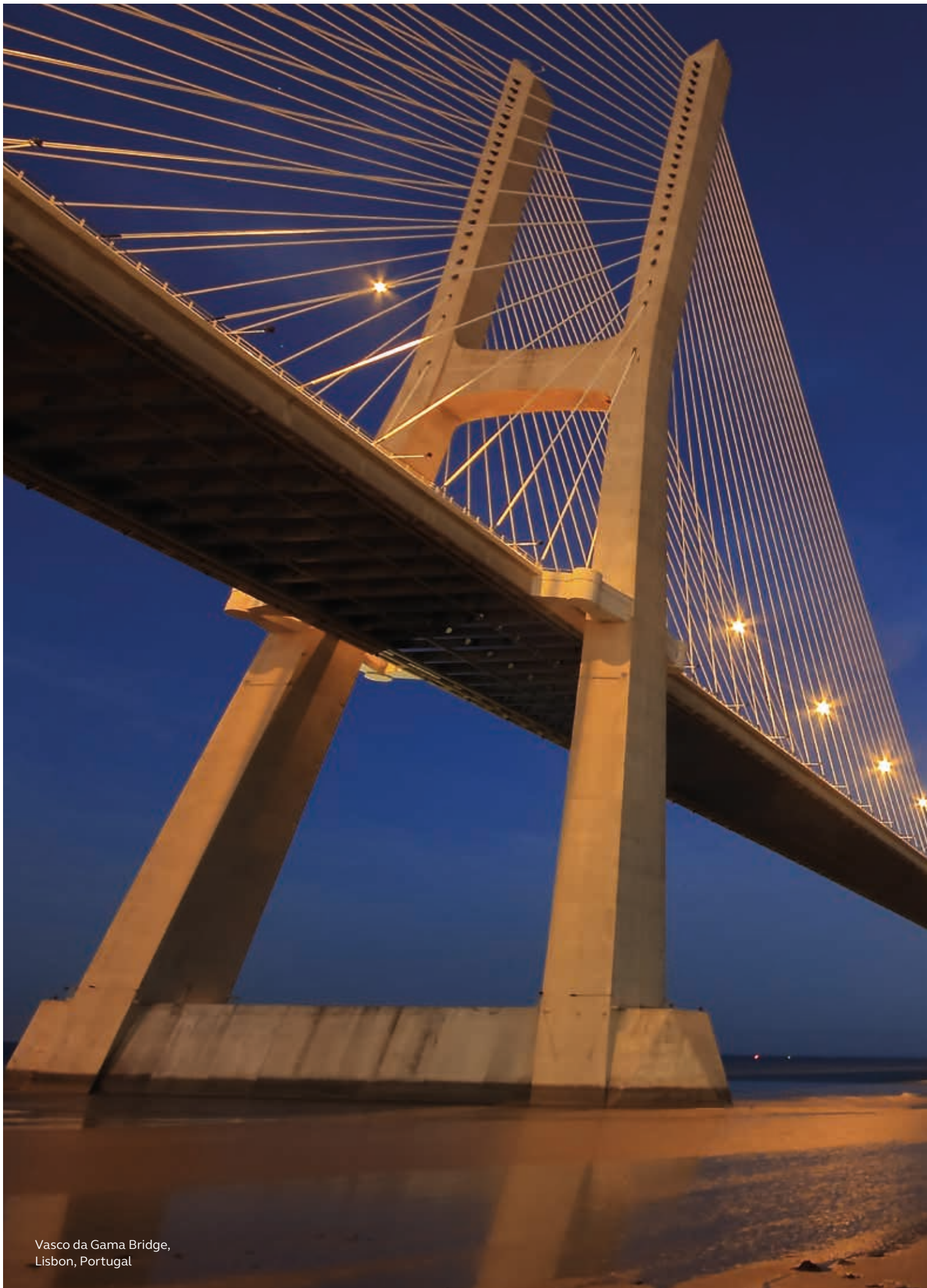
Vasco da Gama Bridge, Lisbon, Portugal