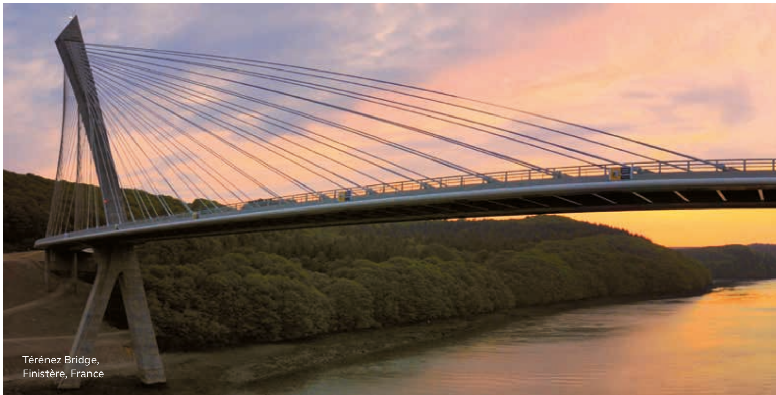
Térénez Bridge, Finistère, France